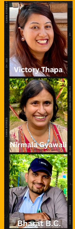
ADSoN Staff in Nepal

2023 is shaping up to be another dynamic year of impact for TRIFC and ADSoN as we continue to grow responsibly and transparently for the benefit of people with disabilities in Nepal.